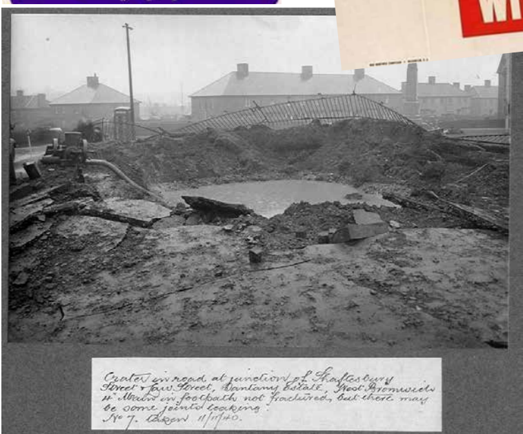
Crater in road, at junction of Grafton Street & New Street, Birmingham, 1941. Footpaths & drains in footpaths not fractured, but there may be some jointed leakings. No 7. 11/1/40.